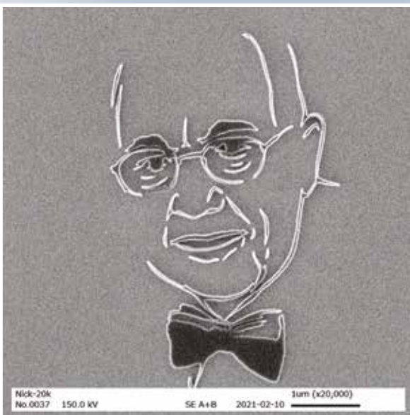
HMNTL is named after Nick Holonyak Jr. who created the first visible Light Emitting Diode (LED) and many of the semiconductor lasers used to communicate information within data centres and between distant locations. This image of Nick was created with a 'printer' which uses a 150kV focused electron beam.