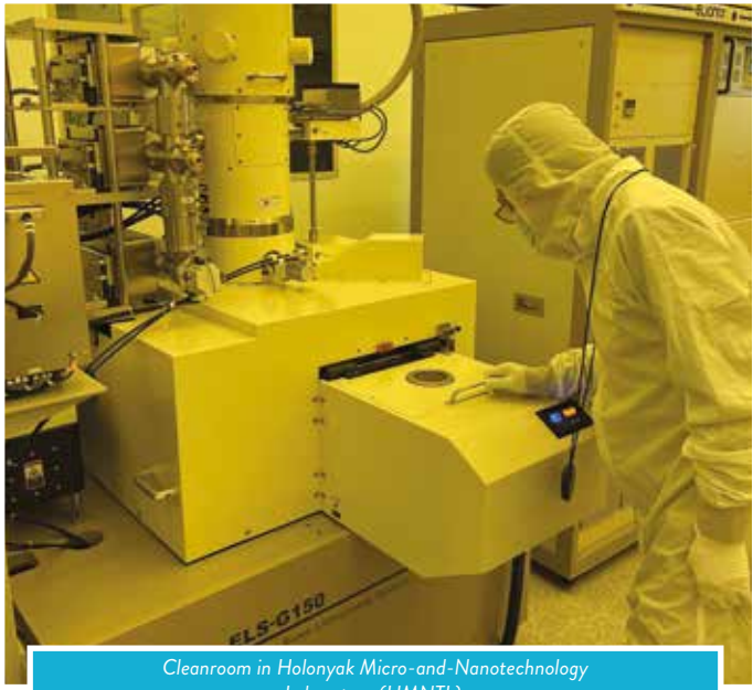
Cleanroom in Holonyak Micro-and-Nanotechnology Laboratory (HMNTL).